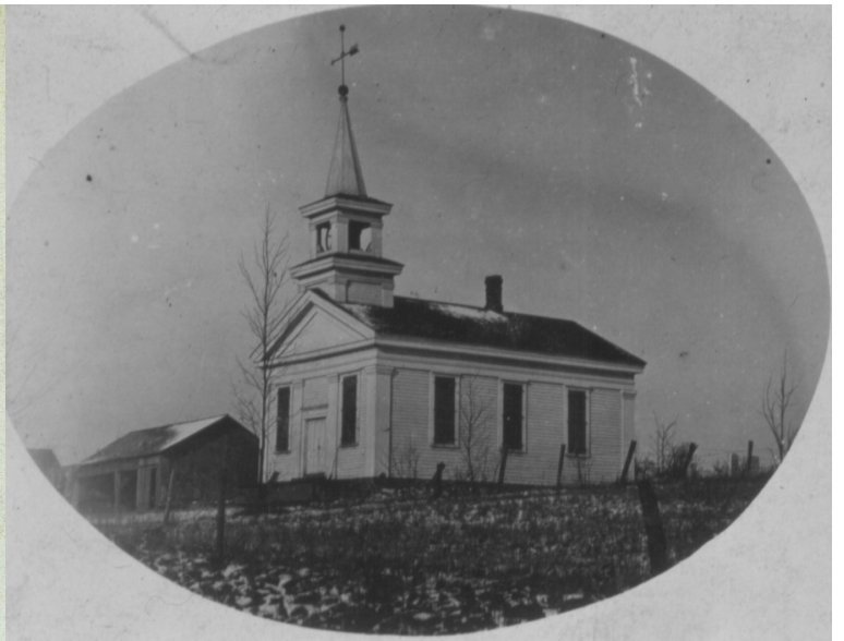
Hartsville Seventh Day Baptist Church